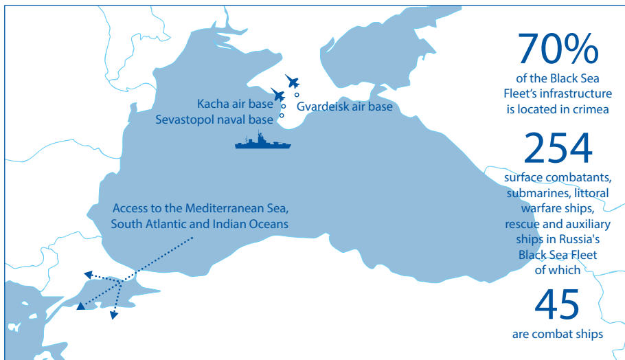
Figure 2 Crimea’s strategic importance for Russia

Official EU policy (March 2015) is based on the premise that ‘restrictive measures against the Russian Federation [...] should be clearly linked to the complete implementation of the Minsk agreements. [...] The European Council does not recognize and continues to condemn the illegal annexation of Crimea and Sevastopol by the Russian Federation and will remain committed to fully implement its non-recognition policy’. 14 This unequivocal stance quickly became the mantra within all of the EU member states. Dutch Minister of Foreign Affairs Bert Koenders echoed this official statement in September 2015: ‘Sanctions remain necessary while Russia refuses to implement the Minsk agreements to resolve the conflict in eastern Ukraine. There is also a separate set of sanctions for Crimea, which will remain in place as long as Russia continues its illegal annexation’. 15 This stands in stark contrast to President Putin’s statement in March 2014 that ‘Crimea is our common historical legacy and a very important factor in regional stability. And this strategic territory should be part of a strong and stable sovereignty, which today can only be Russian’. 16 On the future of Crimea, the EU and Russia are clearly at loggerheads. Policy-makers on both sides have formulated their positions in tough, uncompromising terms, making it hard to see room for flexibility and a diplomatic trajectory towards the ‘middle ground’.