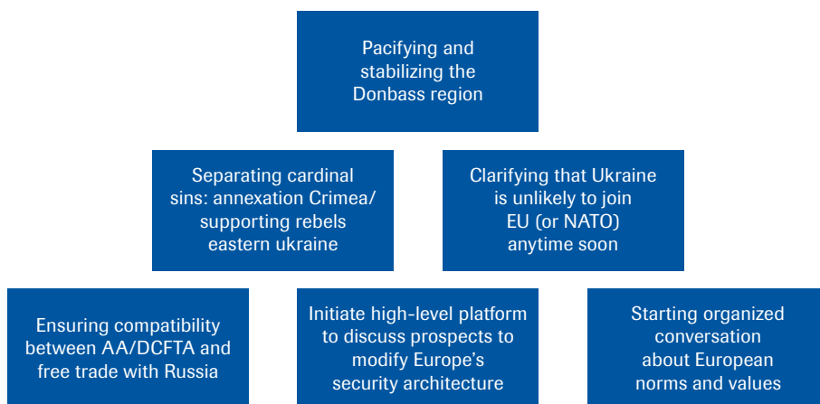
Figure 3 A constructive approach towards Russia

What does this mean for EU policy towards Russia? First , the EU should ensure that Ukraine’s AA/DCFTA (which is signed but not yet ratified) will be compatible with Kiev’s commitments for free trade with Russia (see figure 3). 48 Since February 2015, no fewer than five trilateral meetings have been held (the latest in November 2015), bringing together EU Trade Commissioner Cecilia Malmström, Ukraine’s Minister of Foreign Affairs Pavlo Klimkin and Russia’s Minister of Economic Development Alexei Ulyukayev. The main goal of these meetings has been to ‘find practical solutions to Russian concerns about the implementation of the DCFTA’. 49 Clearly, Brussels now acknowledges that Russia needs to be involved in any future EU–Ukraine trade deal. However, no practical solutions have been agreed, mainly because Russia has – despite