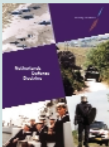
Cover of the Netherlands Defence Doctrine.

The NDD was distributed widely. All flag, general and field officers, as well as civilians working at the Ministry of Defence in similar functions have received copies. Together with the original in Dutch, an English version of the NDD was published. It is also published on the Netherlands MoD’s website ( http://www.mindef.nl/organisatie/beleid/doctrine/index.aspx ).