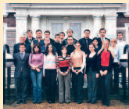
Participants and coordinators of the 28th Course for Junior Diplomats from Eastern Europe, October 2005.