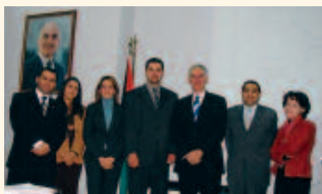
Junior diplomats from the Jordan diplomatic service in the Jordan Institute of Diplomacy.

a one-year course for junior diplomats and programmes in international relations for various governmental institutions. During the workshop on curricula development, the development of interactive diplomatic training and the design of new curricula were discussed. Both parties considered this a fruitful start for future cooperation.