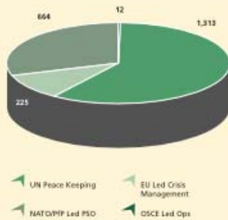
Figure 4.1 Defence Forces overseas deployment categories

A total of 2,214 Defence Forces personnel served individual tours of duty overseas during 2006. Of this number a total of 2,075 served with the four troop missions: