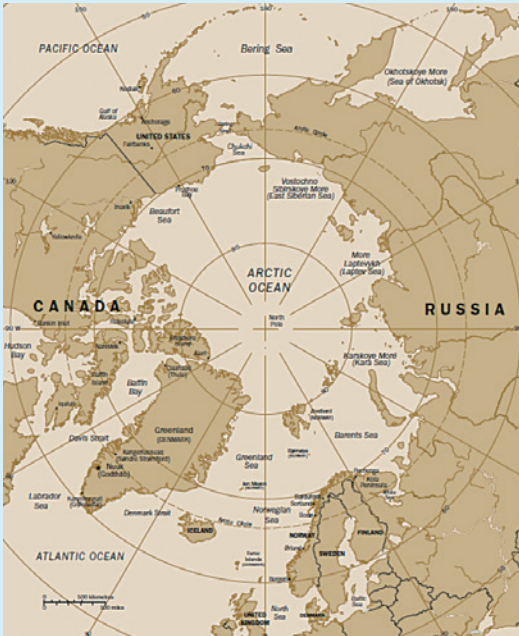
Map of the Arctic coastal states (SIPRI 2012)

For example, in June 2012 the United States began its largest mission ever in the waters of northern Alaska to investigate its ability to guarantee maritime safety, law enforcement, the prevention of pollution, Coast Guard missions, and national security. Denmark also went on an expedition to Greenland in July 2012 in order to prove that the Arctic region belongs to the Danish kingdom. Such operations are expected to increase in scale and frequency in the future (Perry & Andersen 2012).