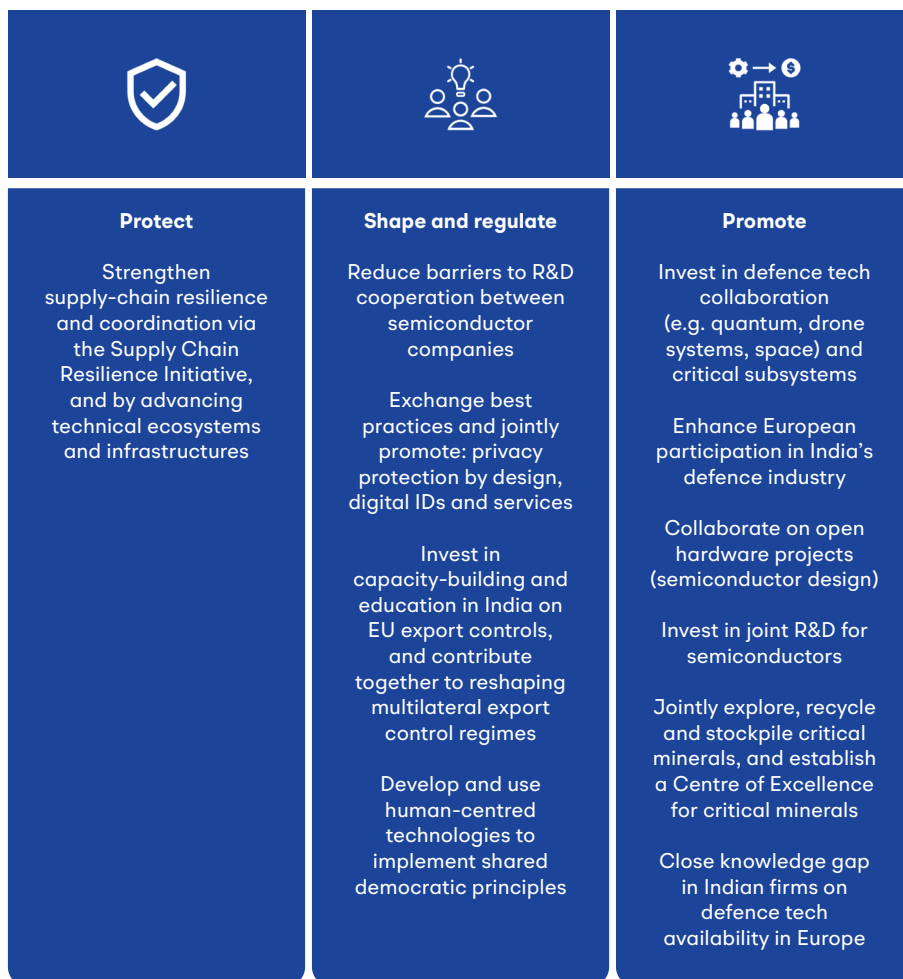
Figure 4 Proposed action to strengthen EU–India strategic tech cooperation