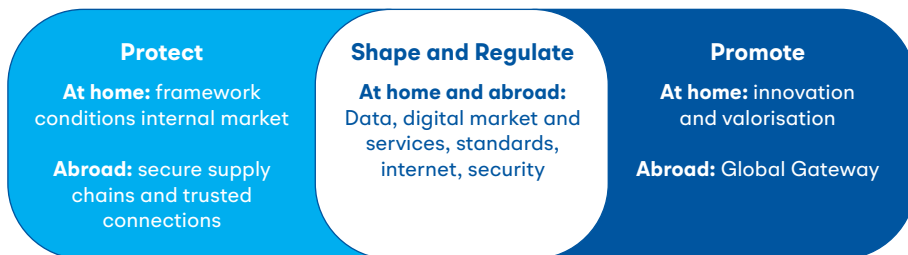
Figure 3 Three courses of action to strengthen strategic tech cooperation