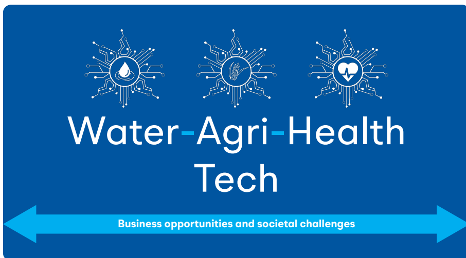
Figure 1 Technology in Netherlands–India relations today: sectoral focus on science, tech and innovation

While Indian officials reportedly sometimes struggle to cite tech sectors beyond water and agriculture where they see Dutch proficiency, engagement with strategic tech sectors other than military and defence has been on the rise in recent years. For example, the Dutch government has received requests and delegations from the Indian Ministry of Electronics and Information Technology and the Indian Ministry of External Affairs, the Embassy of India and the state level on cybersecurity, quantum technology and semiconductors. Technology collaboration between the Netherlands and India also exists in the Joint Working Group on Science, Technology and Innovation between the Indian Department of Science and Technology and the Dutch Ministry of Economy and Climate Policy. This working group focuses on key enabling technologies such as AI, data analytics and space technology in the fields of water, agriculture and health/life sciences.