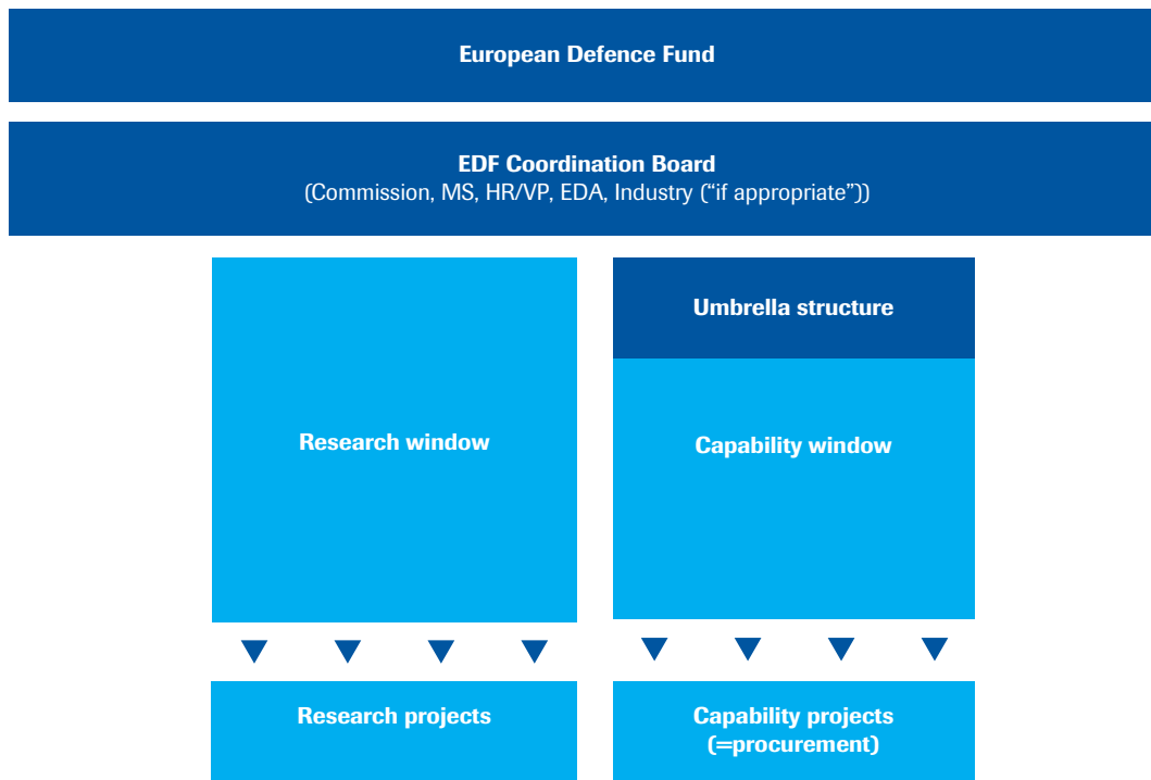
Figure 1 Mixed governance model European Defence Fund

The EDAP foresees such a mixed governance model (see figure 1). The ‘research window’, which is linked to the next Research Framework Programme 2021-2027, is governed through the usual comitology procedures. The ‘capability window’ is designated by the EDAP to be governed by an ‘umbrella structure’ of which the specificities are still very unclear. 2 A second level of projects to develop joint capabilities – in which participating member states decide on the financial and operational decision-making – abides by the rules agreed at the umbrella structure. The two interlinked and interdependent windows are overseen by a so-called ‘Coordination Board’ in which the member states, the High Representative/Vice President, the EDA, the Commission and industry (“if appropriate”) are represented.